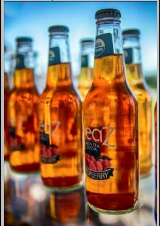
Category: At the market By Carl Shortt, Jr.