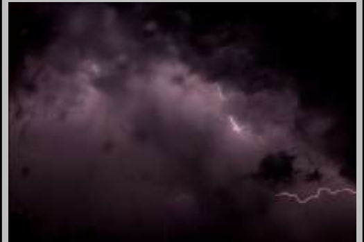
Category: Can you hear it? By: Kaelea Crowell

These are a few of the Honorable Mention photos from the Digital Treasure Hunt.