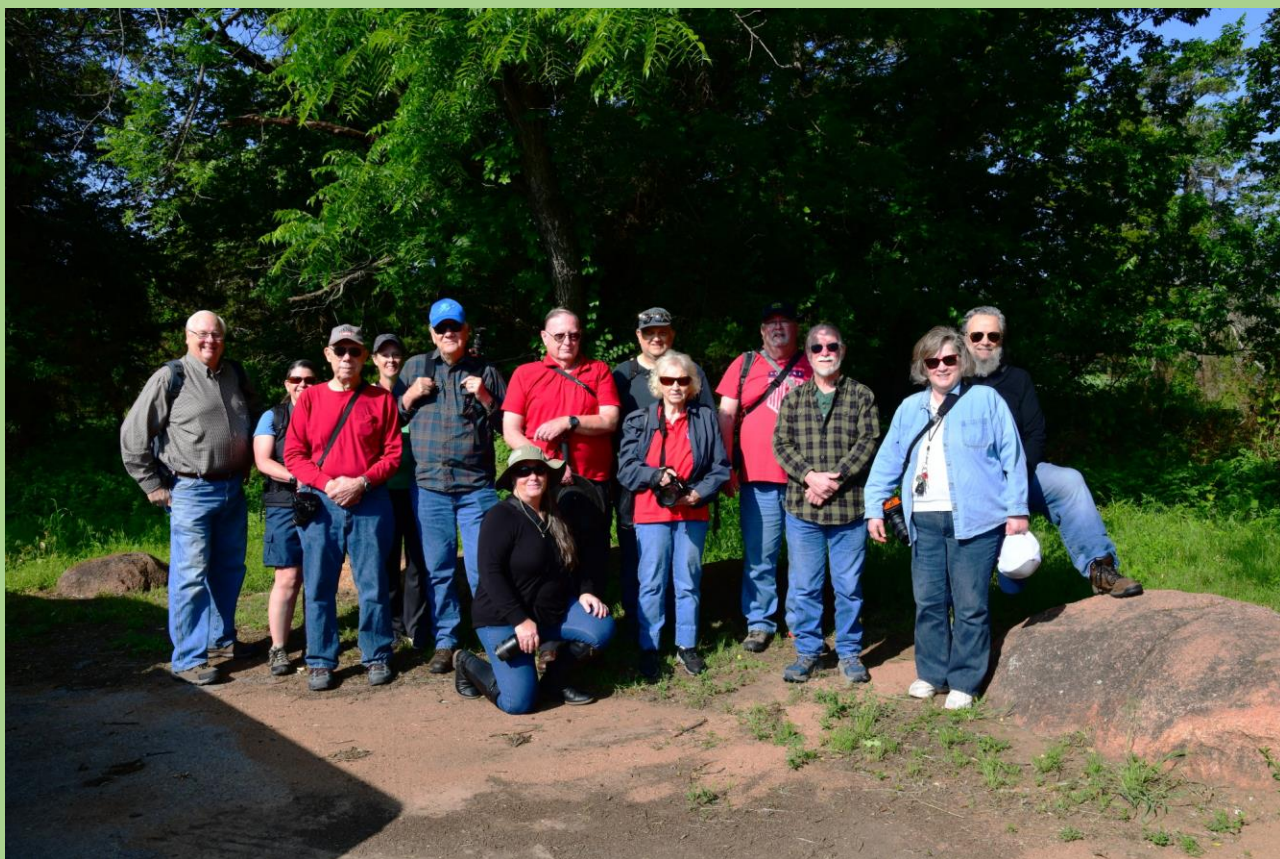
Group Picture of the members attending the May field trip to Wichita Mountains