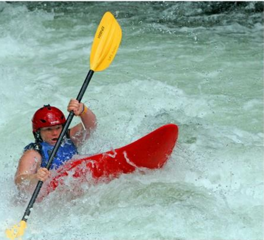
March 2025 Contact Sheet