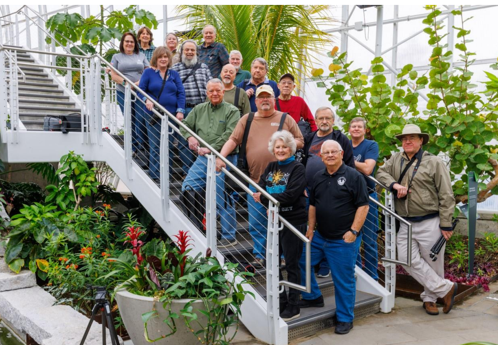
February Group Myriad Gardens

Great chance to photograph the newly renovated Capitol